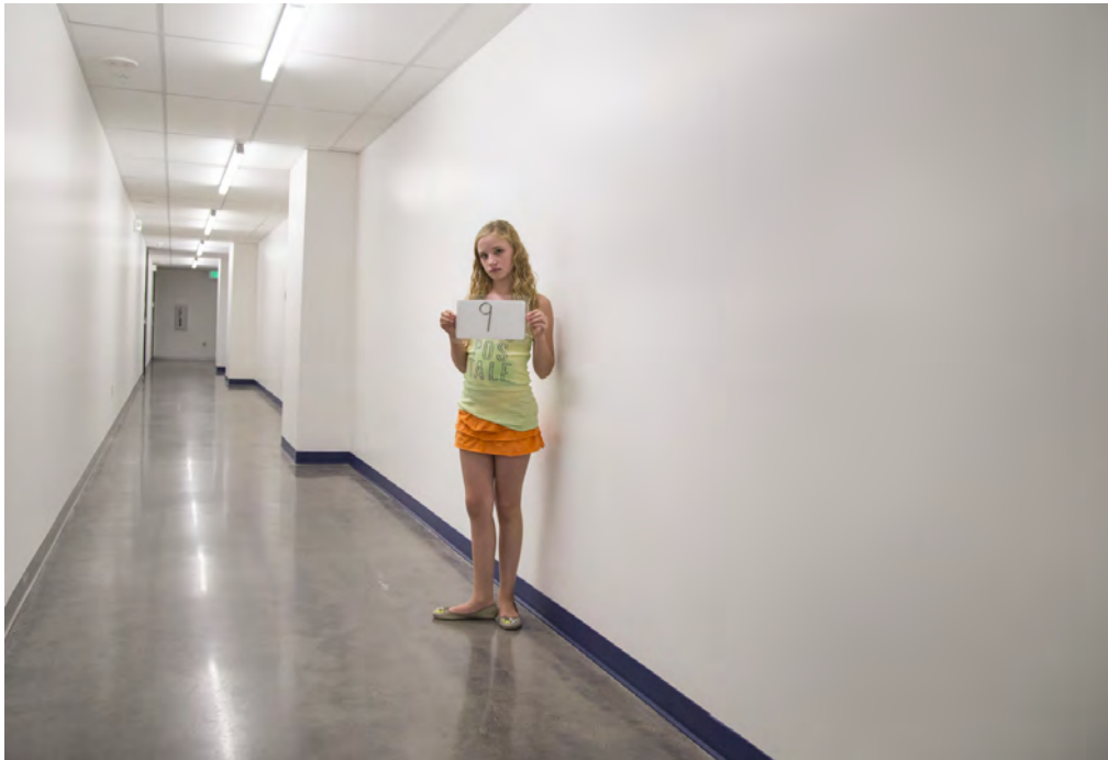
Site 9. LL 1B25 Corridor North Wall Dimensions 8' x 80' x 1' - South Wall Dimensions 8' x 80' x 4"