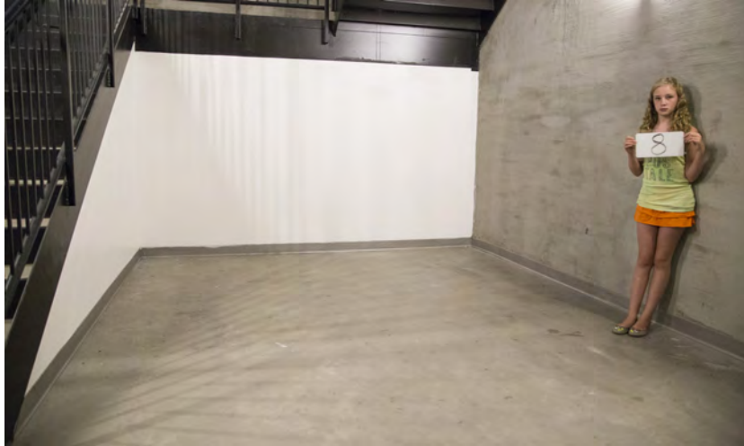
Site 8. LL North Stairwell Alcove Dimensions 8' x 11' x 11'