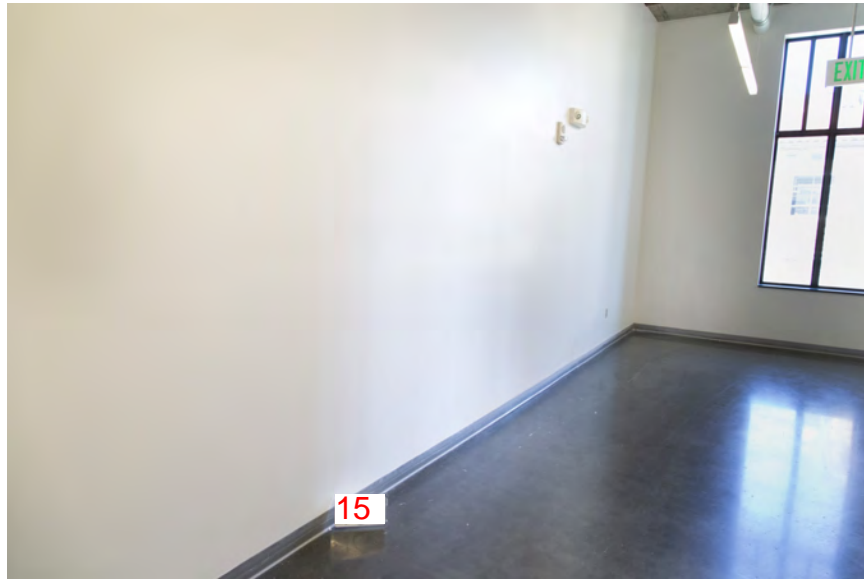
Site 15. Third Floor North Corner Dimensions 11' x 33' x 1'- 6'