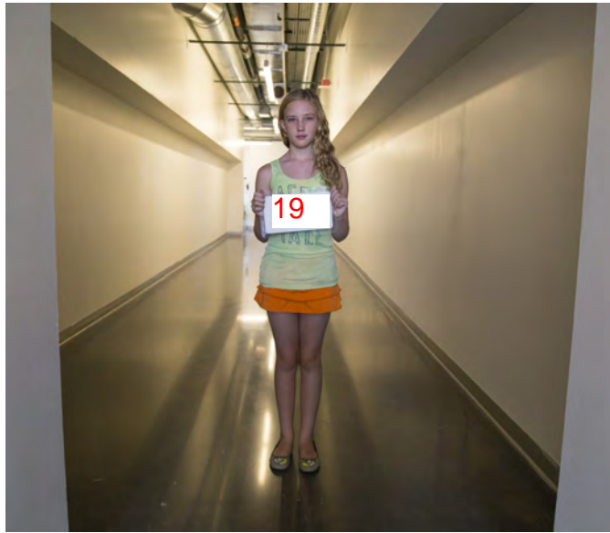
Site 19. Fourth Floor Corridor Dimensions 6' 6" x 45' x 1' (both sides)