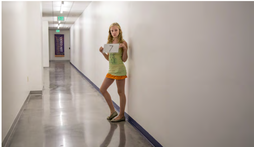
Site 7. LL 1B03 Wall Dimensions 8' x 78' x 4"