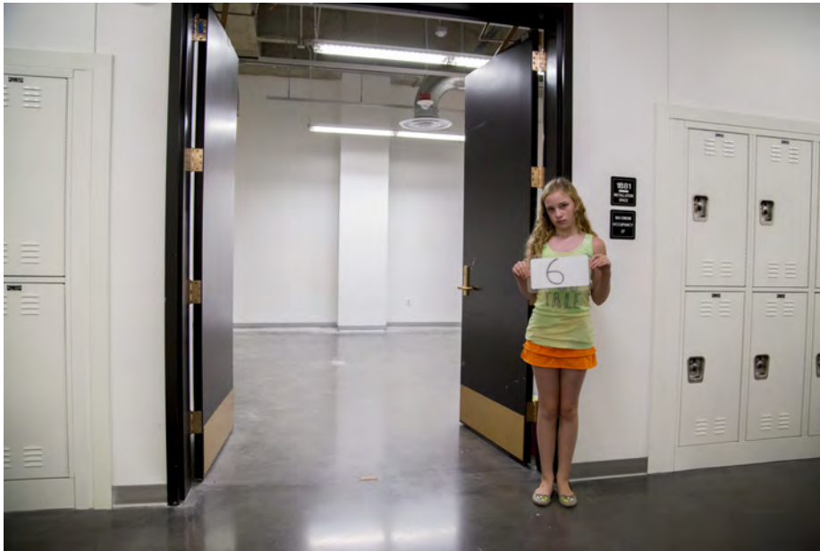
Site 6. LL Room 1B81 Dimensions 11' x 20' x 20'