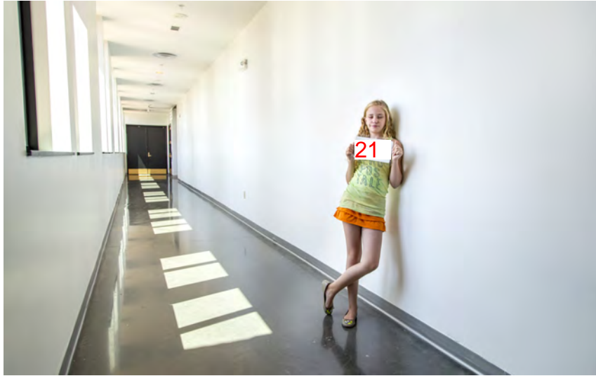
Site 21. Fourth Floor Lobby Dimensions 11' x 55' x 4"