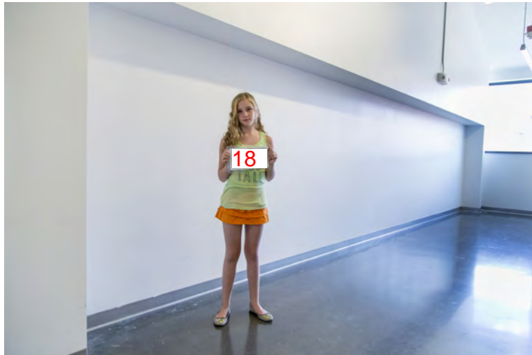
Site 18. Fourth Floor Wall by freight elevator Dimensions 6' 7" x 29' x 1'