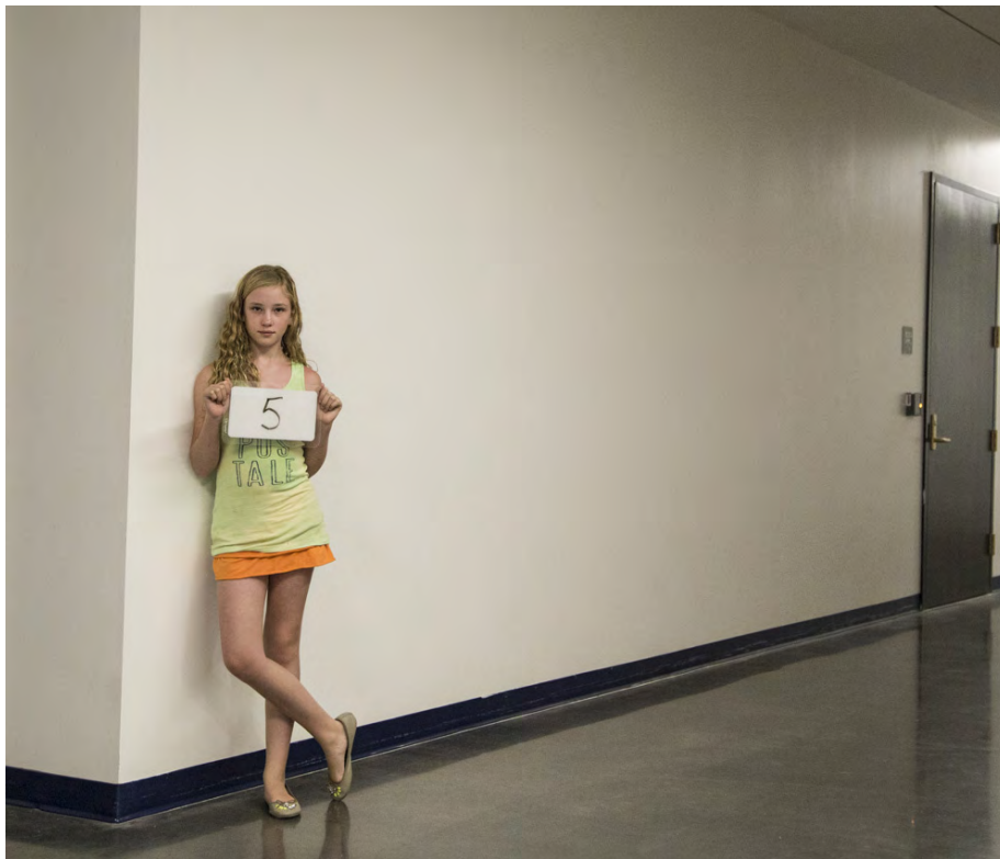
Site 5. LL 1B20 Wall Dimensions 11' x 20' x 1'