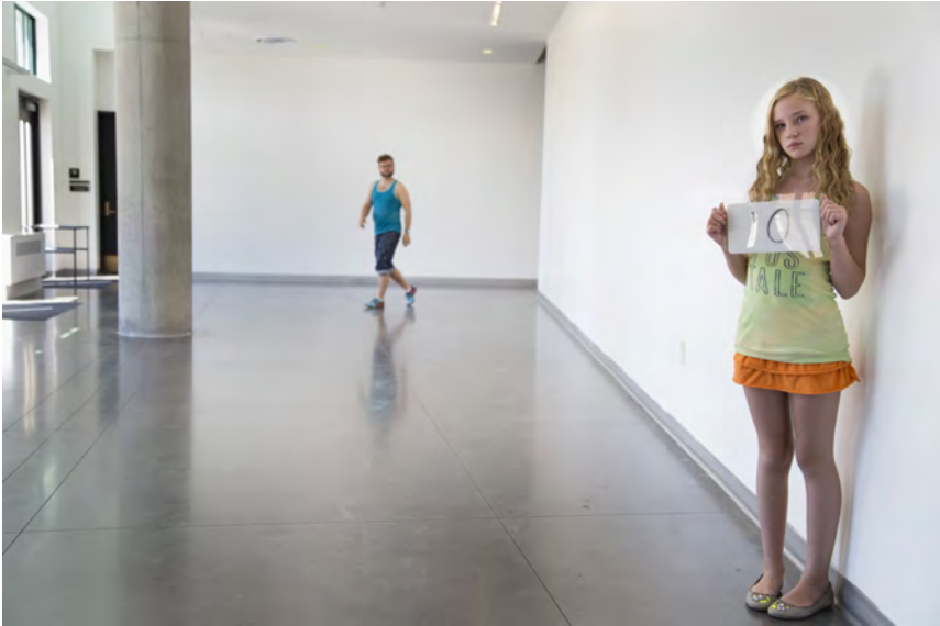
Site 10. First Floor South Lobby Dimensions 11' x 41' x 5'