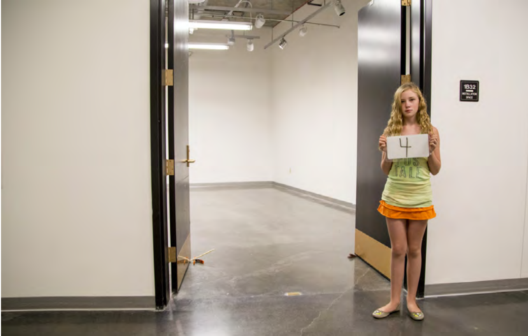
Site 4. LL Room 1B32 Dimensions 11' x 15' 6" x 23'