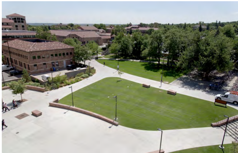
Out of doors, including the VAC Plaza

An exhibition space in the building not listed above must be petitioned for by the student for usage and you must still acquire sponsoring faculty and building proctor approval.