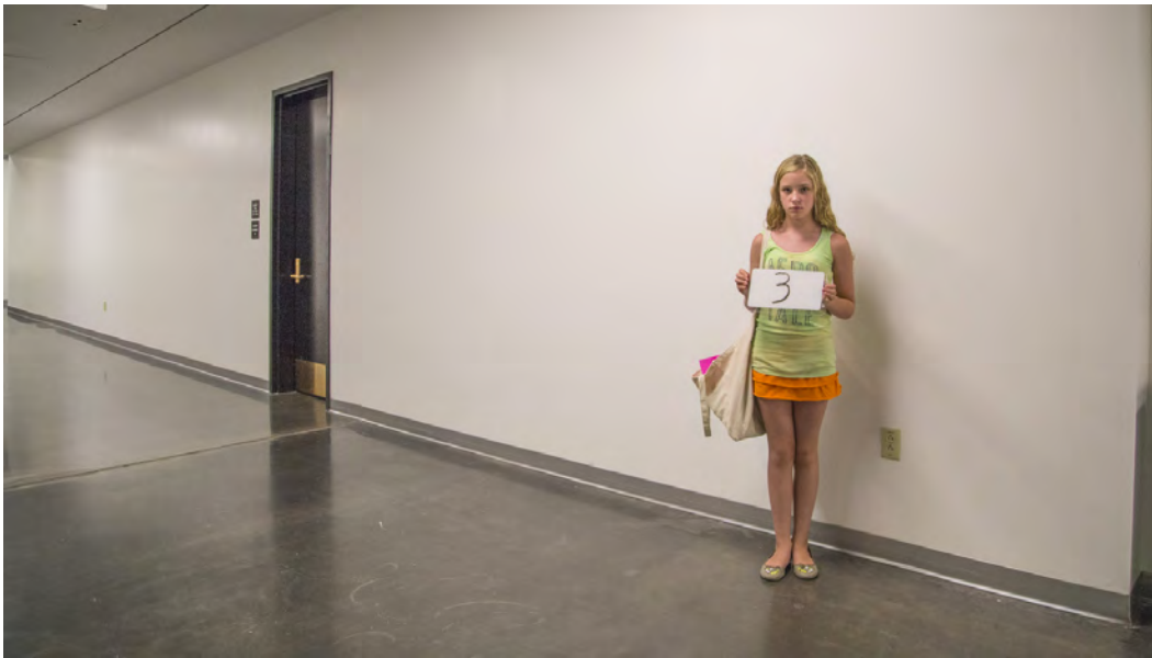
Site 3. LL 1B97 Wall Dimensions of wall left of door 11' x 38' x 1' - Dimensions right of wall 11' x 16' x 1'