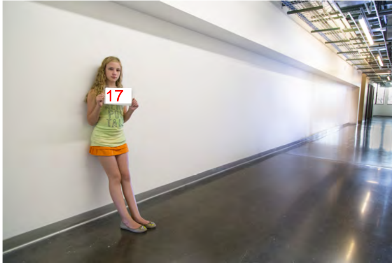
Site 17. Fourth Floor 471 Wall Dimensions 6' 7" x 52' x 1'