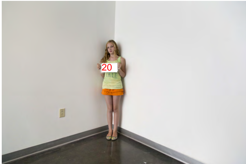
Site 20. Fourth Floor Corner Dimensions 11' x 5' x 5'