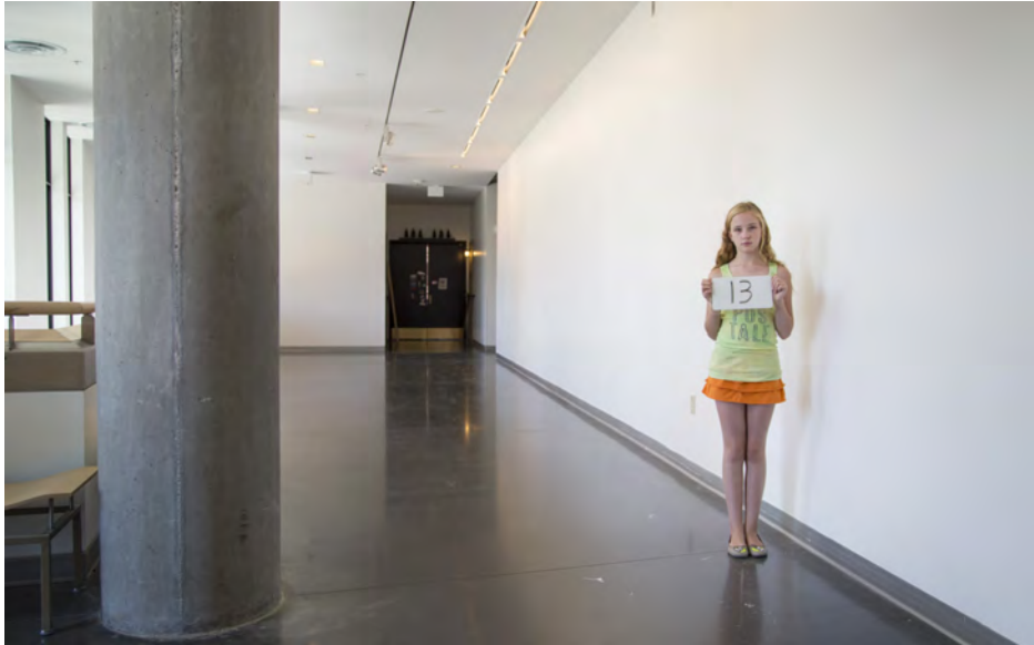
Site 12. Second Floor Lobby Dimensions 11' x 45' x 4'