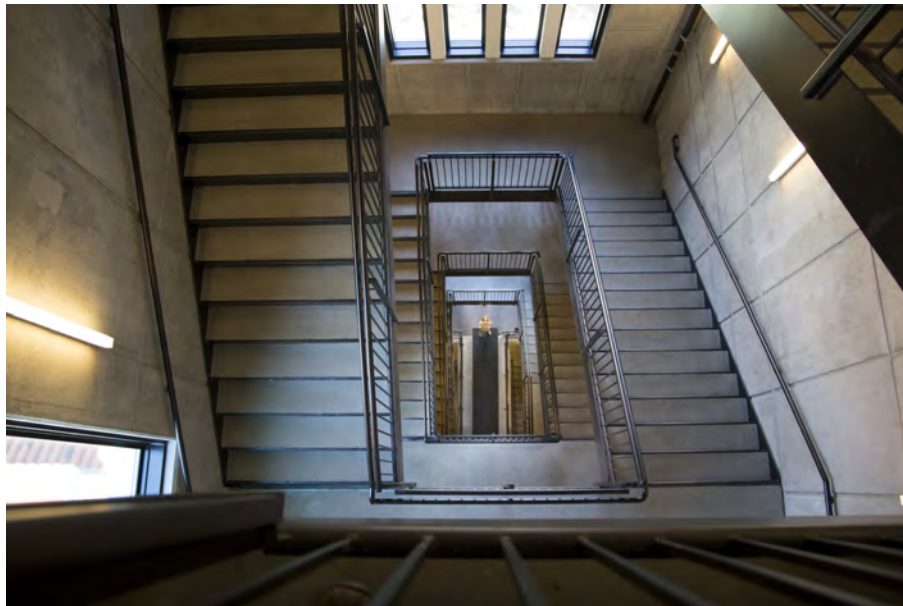
Site 16. Third Floor North Stairwell Special concerns during installation and deinstallation. You must present a plan to the building proctor.