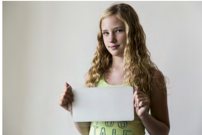
Site 22. Non-Official Exhibition spaces

The 'non-official' exhibition spaces are not overseen by the Department Staff. Students may contact the area coordinators for availability of non-official exhibition spaces within their area.