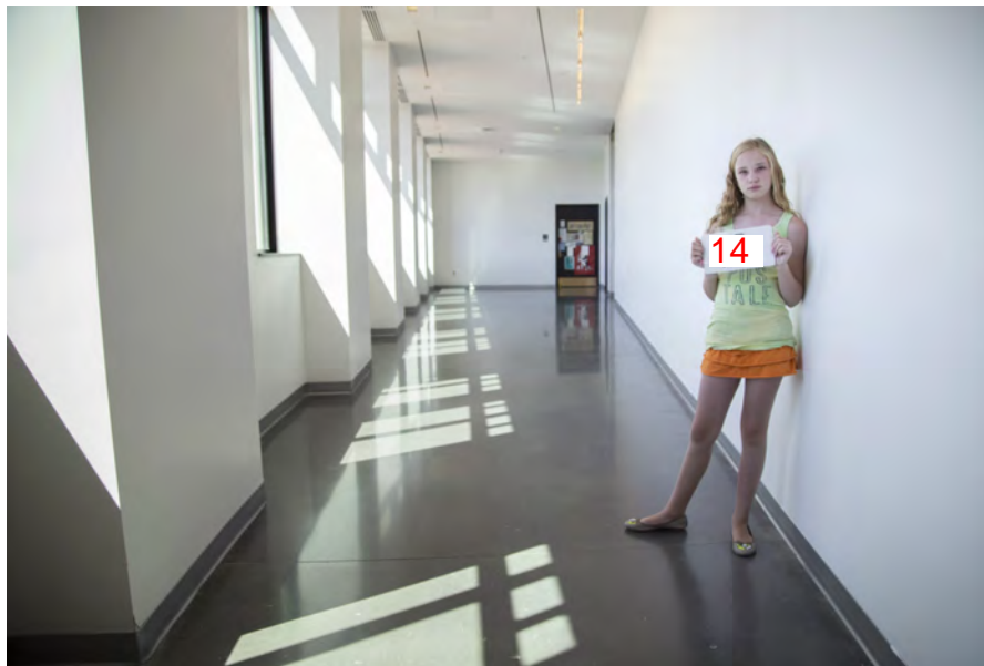
Site 14. Third Floor Lobby Wall Dimensions 11' x 50' x 4"